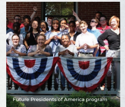
Future Presidents of America program