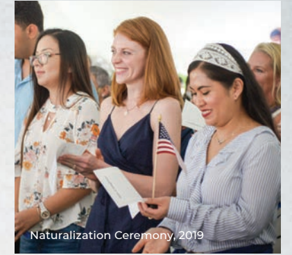
Naturalization Ceremony, 2019