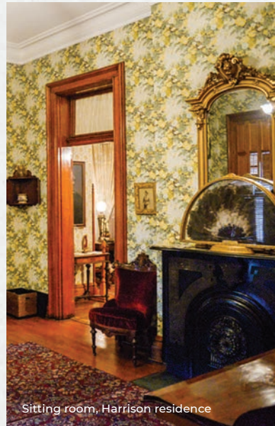
Sitting room, Harrison residence

WE HAVE INSPIRATION. WE HAVE THE VISION. NOW WE NEED YOUR HELP.