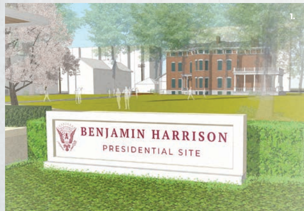
1. Presidential Commons and signature signage 2. Neighborway and public art 3. Presidential Commons and Citizenship Plaza project 4. Citizenship Plaza, Centennial Flagpole 5. Presidential Promenade: every step will recognize a preceding presidential administration

Your financial support of our “Old Glory, New Vision” campaign will be multiplied by this generous matching grant. But even more important, your participation will multiply our efforts locally and nationally to increase public participation in the American system of self government.