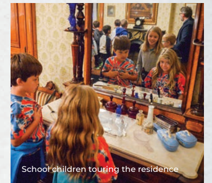
School children touring the residence