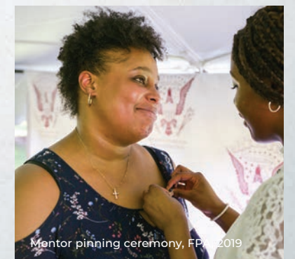
Mentor pinning ceremony, FP, 2019